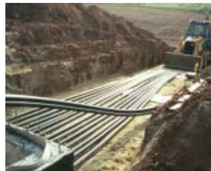
3. "Pigtail" pipes coming from the individual heat exchangers join at the valve pit (lower left).