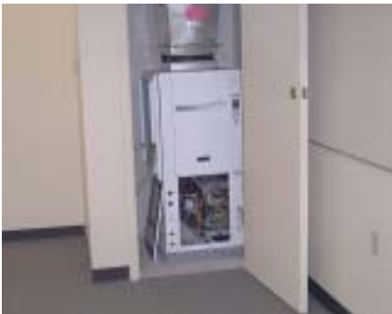
7. A heat pump in the classroom. The heat pump is located in a closet for easy maintenance.

In addition to supplying energy for heating and cooling, the ponds provide educational opportunities. Students have planted grasses along the shores, and thanks to a corporate grant, students are measuring the ponds' temperature and acidity. Two rowboats are available for research activities.