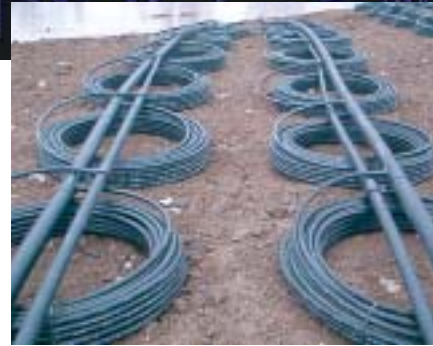
1. Heat exchangers being assembled on the shore of the pond. Each coil provides one ton of heating and cooling capacity.

Three factors help replenish the pond's energy. In the winter, a thick layer of ice insulates the pond from cold outdoor temperatures, while in the summer evaporation drives off excess heat. The ground stays at a near-constant temperature of 50°F, which keeps the ponds at an even temperature.