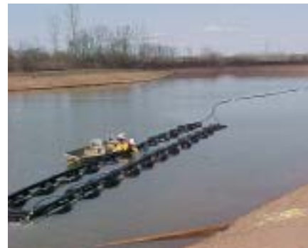
2. A heat exchanger being floated out to the middle of the pond. The unit will later be weighted and sunk.