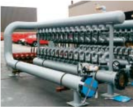
5. Header plumbing before being installed in valve pit.