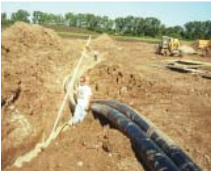
6. Main feed lines coming to and from the school.