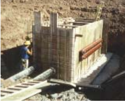
4. This box, called the valve pit, joins the heat exchanger pigtail pipes to the main feed lines for the school.